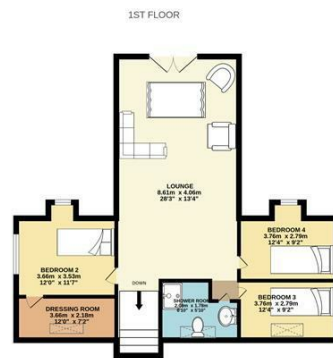
4 BEDROOM DETACHED HOUSE

Whilst every attempt has been made to ensure the accuracy of the floorplan contained here, measurements of floors, windows, rooms and any other items are approximate and no responsibility is taken for any error, omission or mis-statement. This plan is for illustrative purposes only and should be used as such by any prospective purchaser. The services, systems and appliances shown have not been tested and no guarantee as to their operability or efficiency can be given. Made with Metropix C2025